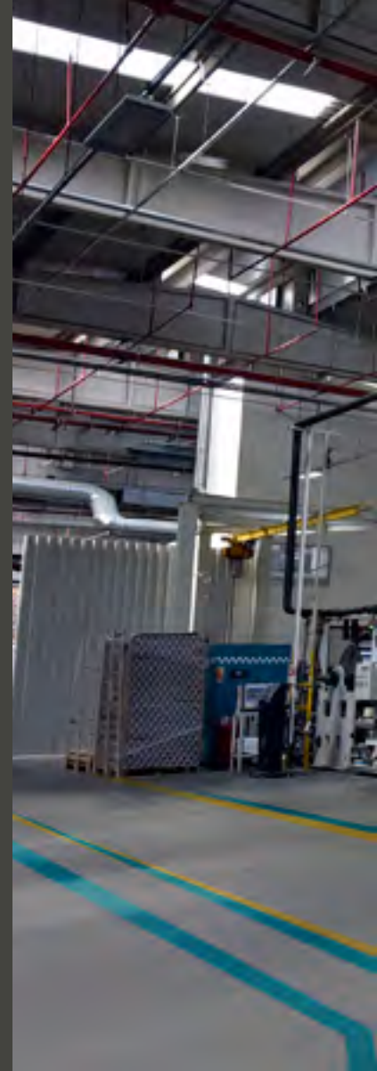
ELBA, Çerkezköy, Tekirdağ